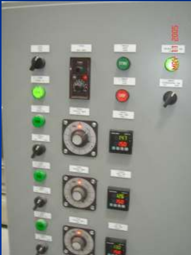
Monitors and Controls System Parameters