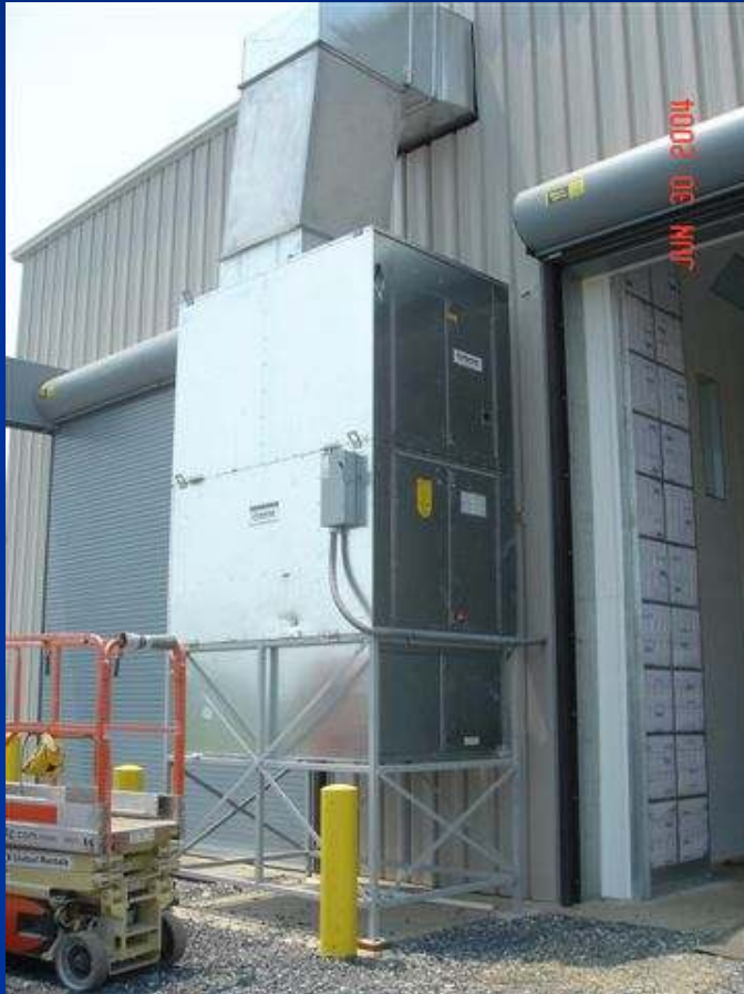
Vertical Outdoor Unit