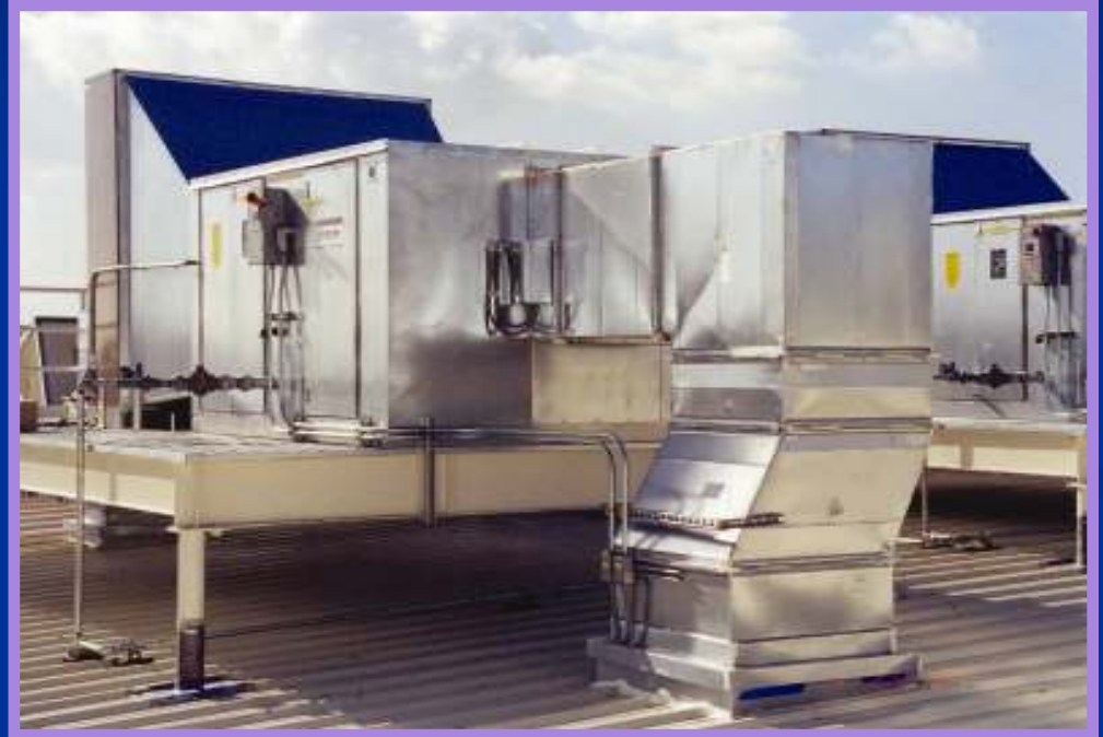
Roof Mounted Units With Evaporative Coolers