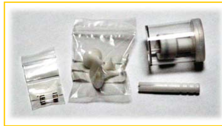
Thermal delay fuse, deflector cone assembly, fan spray nozzle assembly and wedge tool