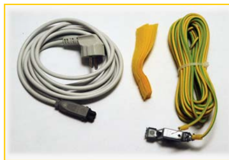
Mains cable, velcro fastener and grounding cable