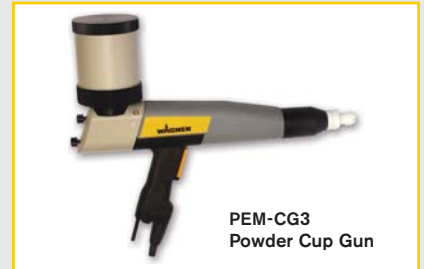
PEM-CG3 Powder Cup Gun