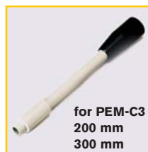
for PEM-C3 200 mm 300 mm