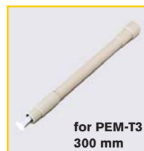
for PEM-T3 300 mm