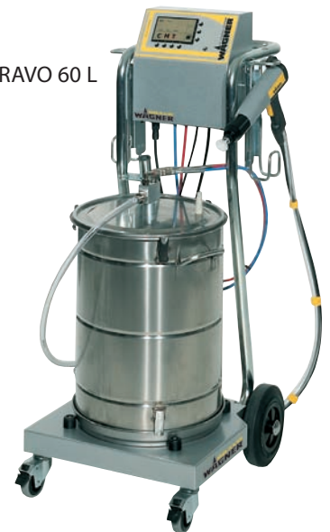
BRAVO 60 L