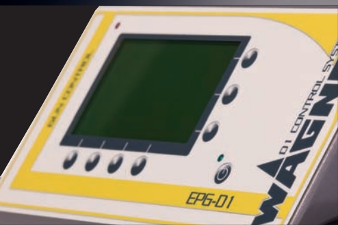
Controller EPG BRAVO