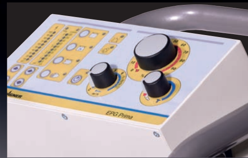
Controller EPG PRIMA