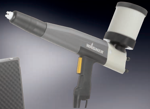
The feed-cup gun with convenient carrying case