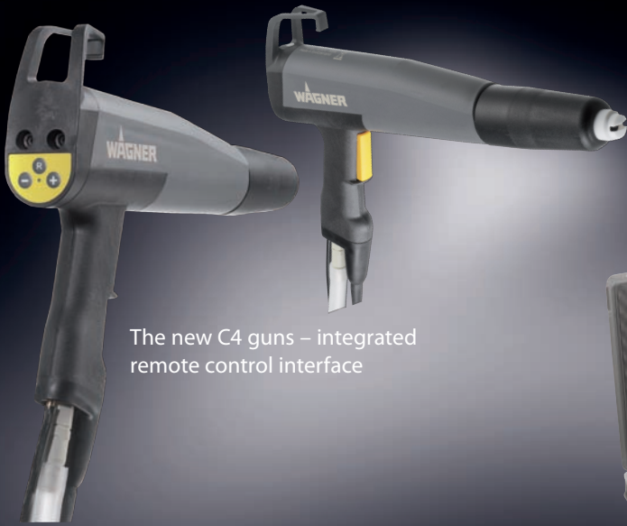
The new C4 guns – integrated remote control interface